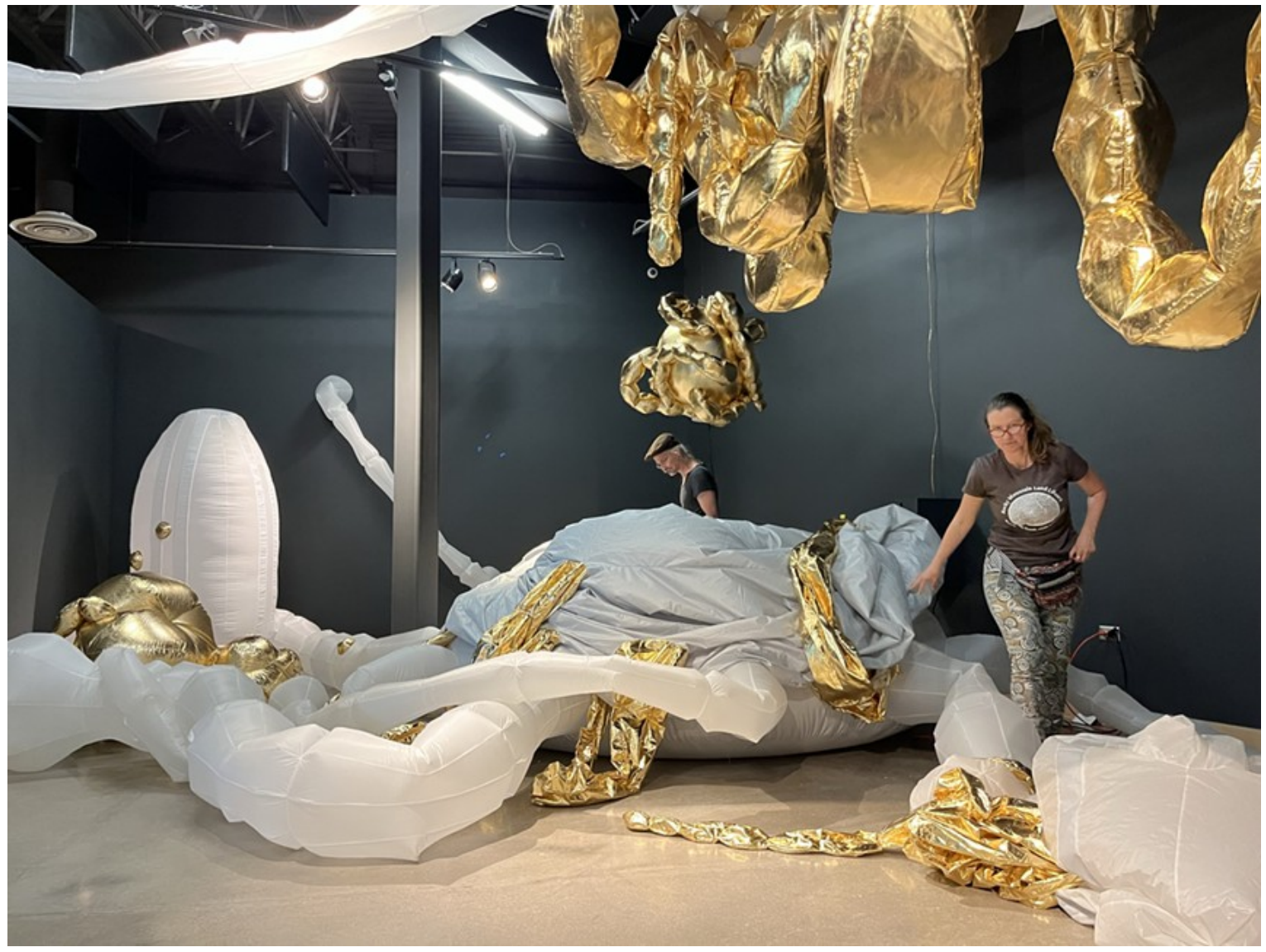
Setting up Nicole Banowetz's inflatable installation for agriCULTURE.