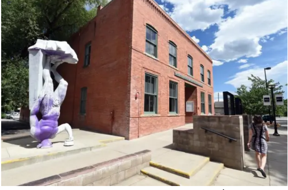
A woman walks past BMoCA in 2017.