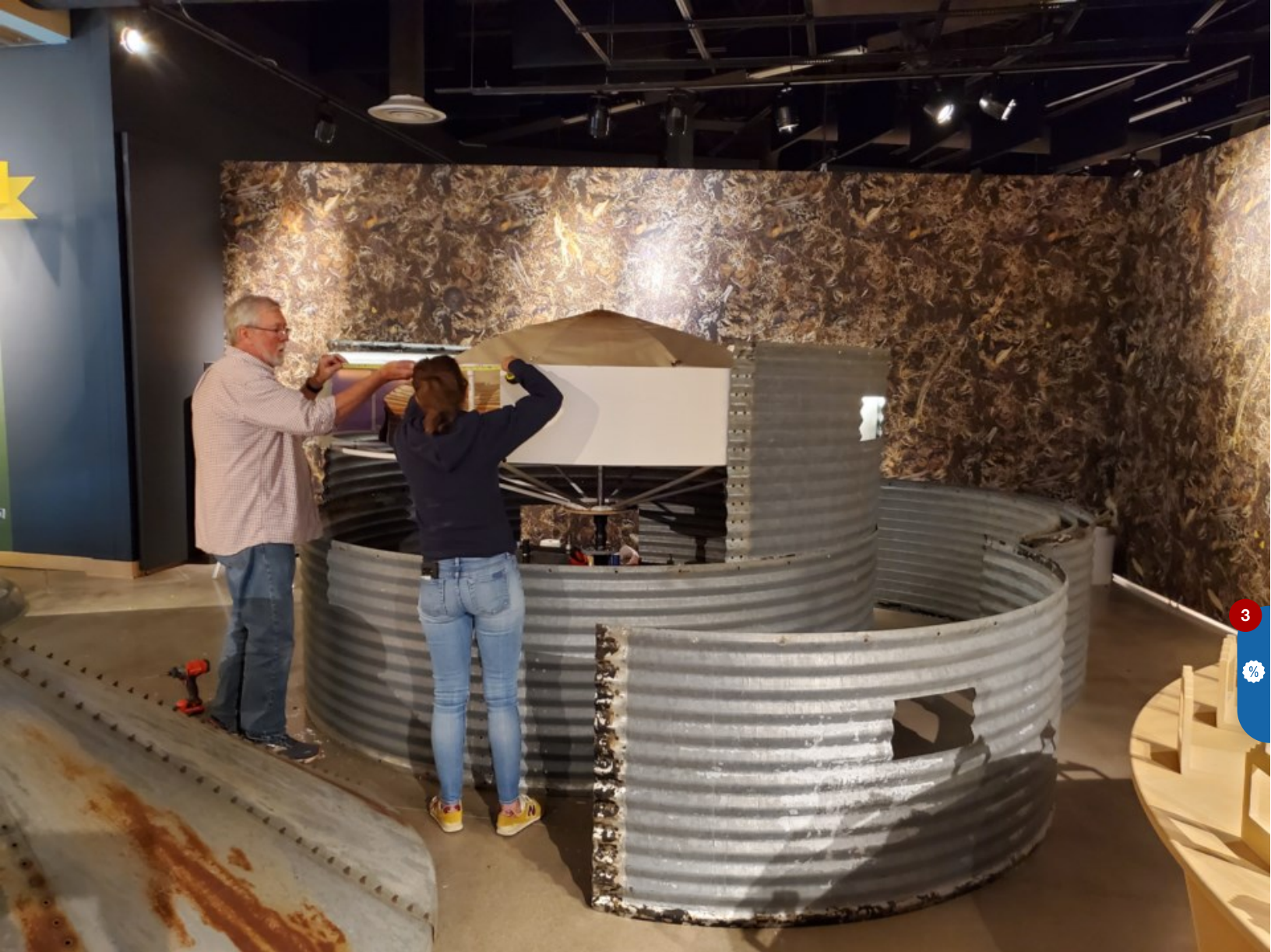
agriCulture: Art Inspired by the Land begins June 9 at the Longmont Musuem