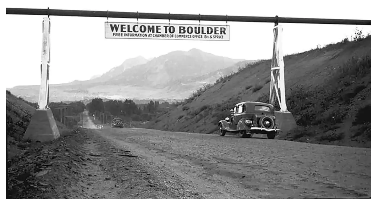
A 1937 view of a sign over Broadway, north of Linden, reading "Welcome to Boulder. Free information at Chamber of Commerce office, 13th & Spruce." The sign hung from a pipe that was part of the irrigation system. Visible in a circa 1960 aerial photo, the sign was possibly removed in the mid-1960s.

"Boulder's last frontier," declared a 1985 article in the Daily Camera 's Sunday Focus magazine. It was a multi-page spread all about what we know today as North Boulder: dozens of stories and photos detailing the "rural" and "free-wheeling spirit" of this "world within a world."