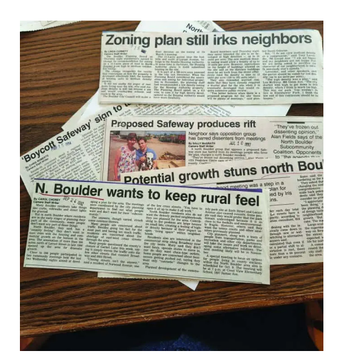
A smattering of Daily Camera clippings from the early to mid-90s demonstrate the depth of opposition to City plans for development in North Boulder.

we don't want your codes, we don't want anything. The City came up and [tried] to city-fy us. We would just scream them down."