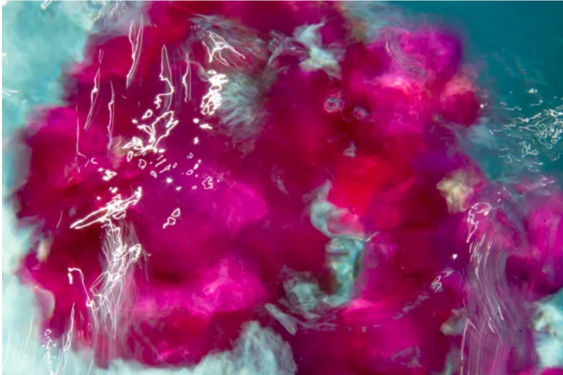
Kevin Hoth's photos power the show "Wild Narratives" at Walker fine Art.

Info: 6851 W. Colfax Ave., located in the 40 West District. Lakewood. 303-297-8428 or coreartspace.com . Free.