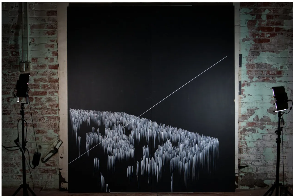
Kevin Townsend's drawing are part of his solo show at the Boulder Museum of Contemporary Art.